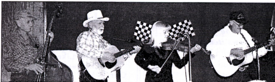
A Mixed Up Bunch