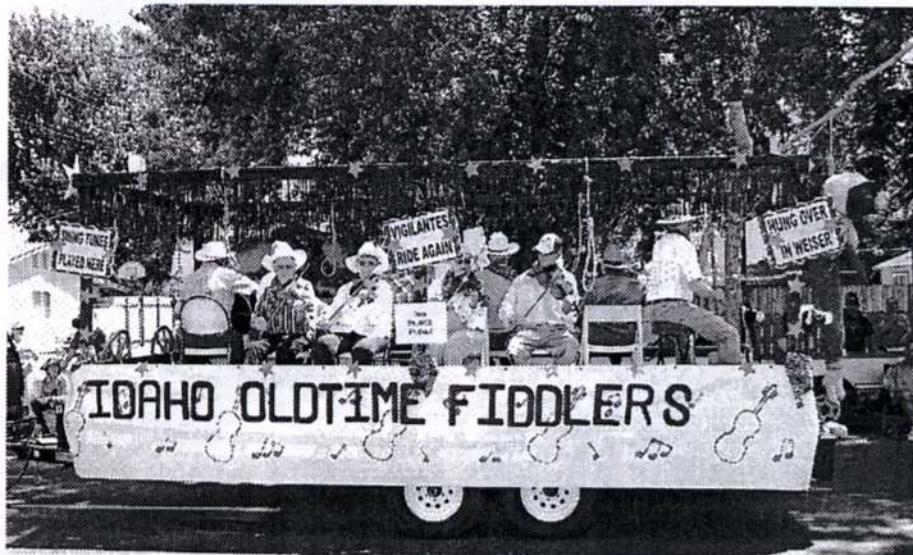
Third Place Float – National Oldtime Fiddlers' Contest Parade