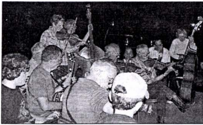
Three Rivers Campout submitted by Gary Bloomfield, District 9