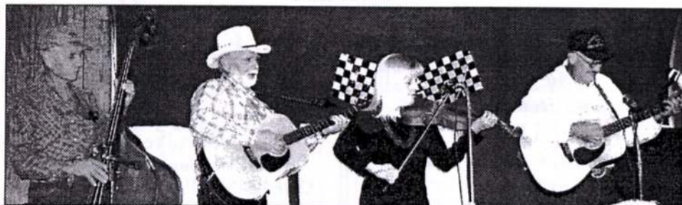
A Mixed Up Bunch