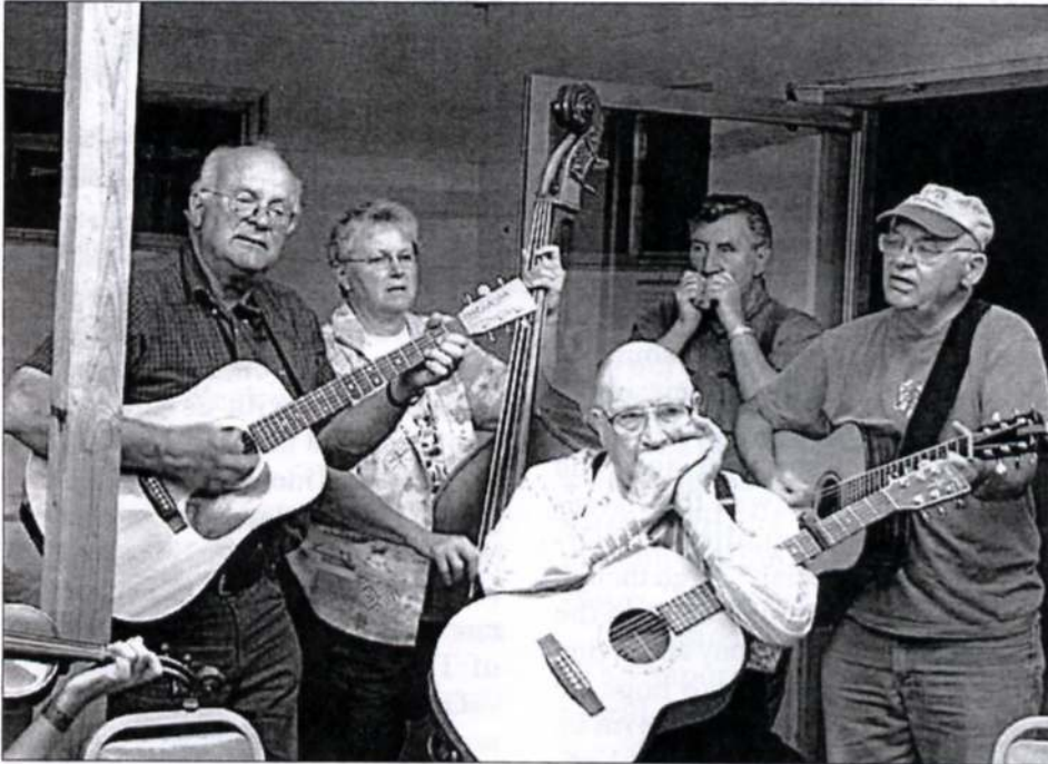
Jamming at the Three Rivers Campout.