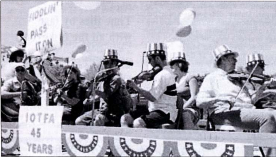
2008 National Oldtime Fiddlers' Contest Parade Entry